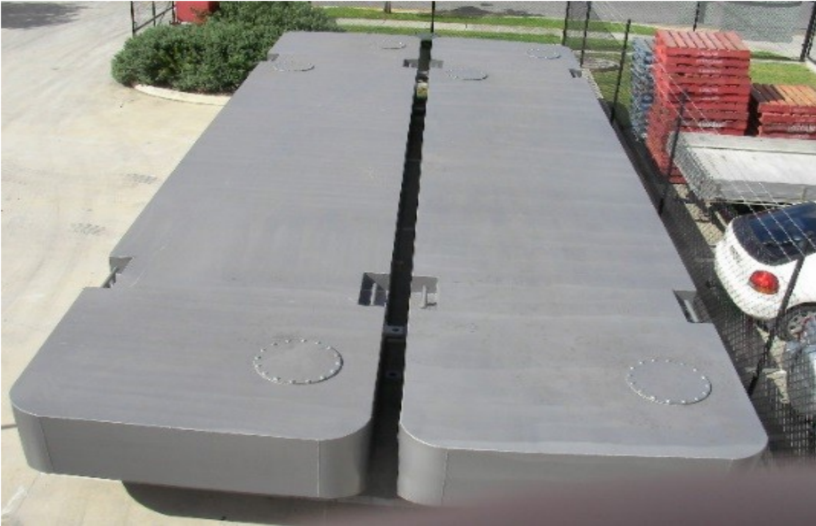
Barge - Modular